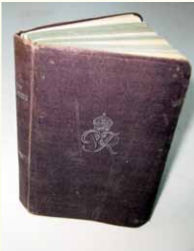
New Testament with the Psalms 1943 King George VI

During the Second World War, the King wrote this Preface to the King James text and authorised printing half a million copies for distribution to those on active service in the armed forces of Great Britain. This was the Royal message from King George VI.