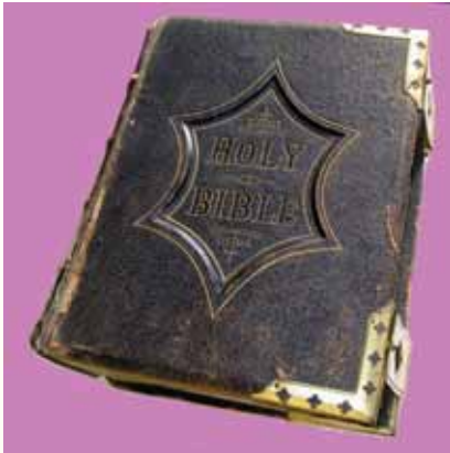
The King James Family Bible of 1858 Bible

greatness... Our Scriptures are the legacy of the Reformation ... in consequence of Anglo-Saxon Protestantism and enterprise, the sun never sets on the English Bible."